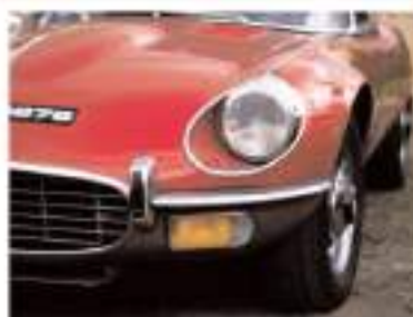
Jaguar E-Type wanted

For more details call Abed Farhan 503-481-2233.