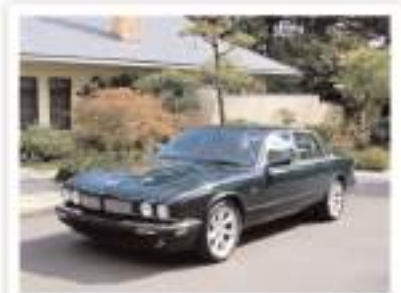
2002 Jaguar XJR