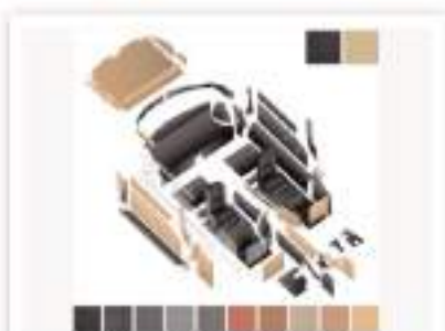
Jaguar XKE S2 4.2 FHC MOSS Complete MOSS Interior KIT

New, in box! I am selling a complete Moss interior kit in Cinnamon. #IT-2030. It came with the car, but I'm doing red.