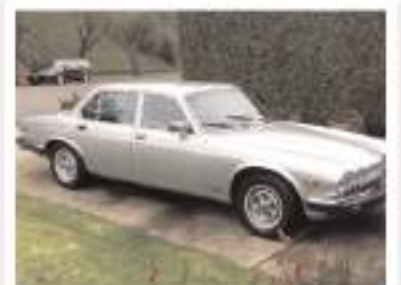
1987 Jaguar XJ 6 for sale

Please call 503-481- 2233 or email: trends2012@live.com