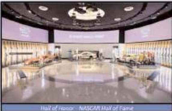
Hall of Honor - NASCAR Hall of Fame

In the early afternoon the shuttle will return you to Charlotte for a visit to the NASCAR Hall of Fame across the street from the hotel, where you can experience the rich history of stock car racing in the U.S. or choose to explore Uptown Charlotte. We will gather back at the Hall of Fame for a cocktail hour at 5:30 PM, followed by dinner at 6:30 in the Hall of Honor.