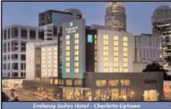
Embassy Suites Hotel - Charlotte Uptown

Please join us for the JCNA AGM which will be held at the Embassy Suites - Charlotte Uptown. The hotel is near the center of the city and is walking distance to museums, restaurants, parks, and sports venues.