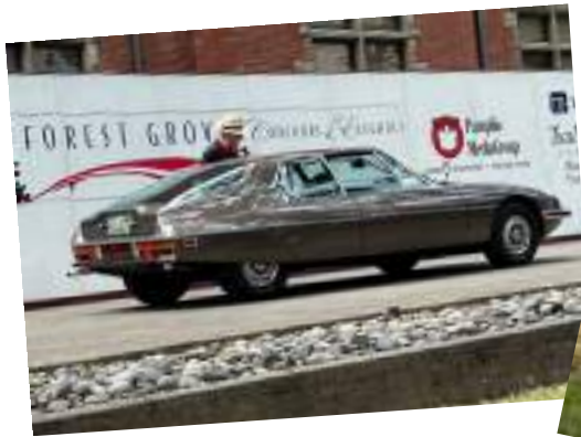
Photo Gallery from Forest Grove