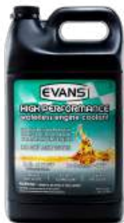
Rendering/Image© Evans Products

hot either, but it does have some disadvantages which I'll cover below. I've mostly used their racing product to date, but they also have a collector's car version which they advertise as having a greater focus on preservatives rather than high temperature performance so ideal for our vehicles, but I've never used this myself (and didn't know about it until recently).