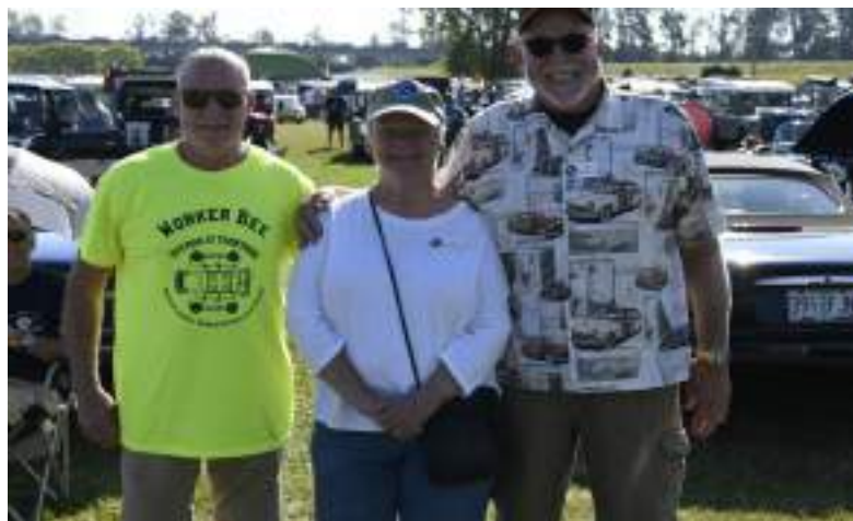
Another teaser from ABFM 2024