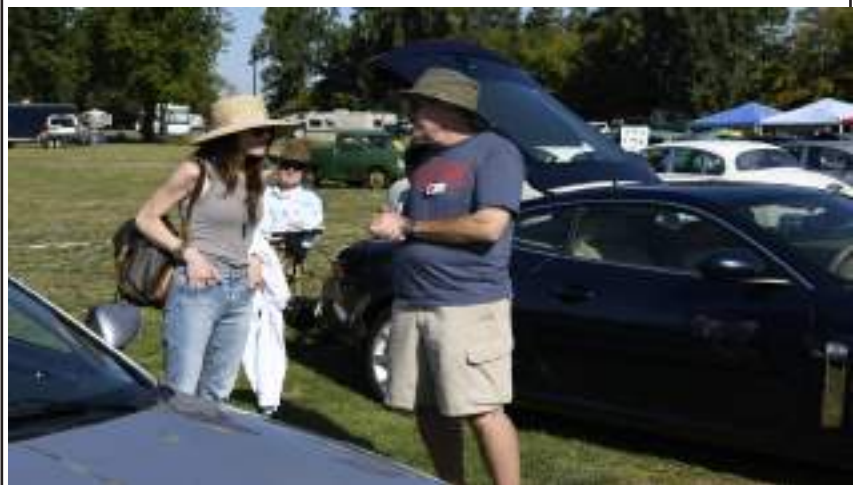
This is a teaser image for the write-up and photos of the 2024 ABFM in the next issue of The Cat Fancier