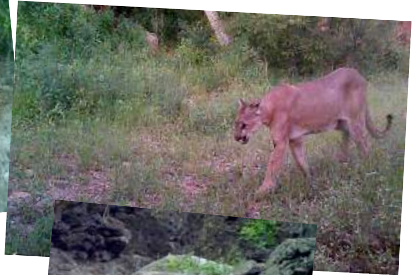
More photos of the Northern Jaguar Project