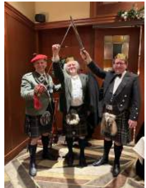
There was a command performance by "The Three Graces of Glasgow" as part of the entertainment.