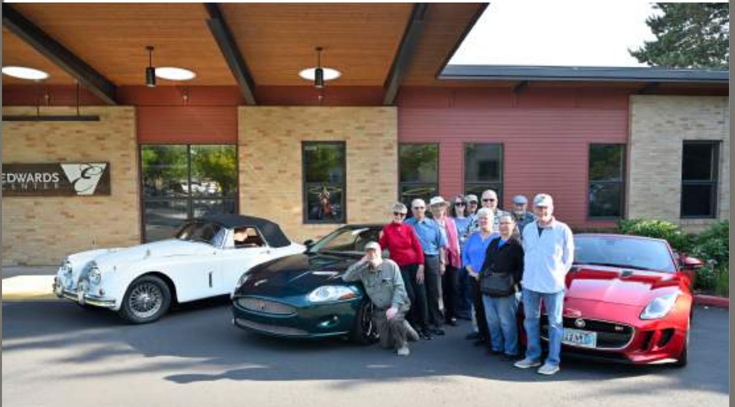
JOCU's Jaguars at the Edwards Center's Prom Night